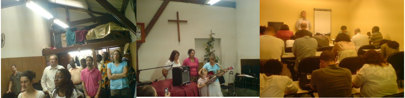
Paris church above and London church below with the new hall rented recently