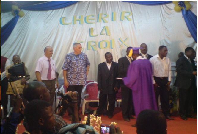
45 graduates: 2-3-4 years diplomas and associate pastors