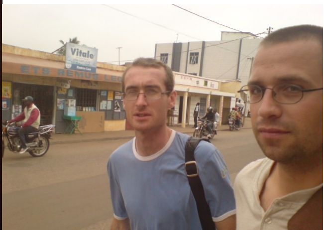
Don't we look like spies?...